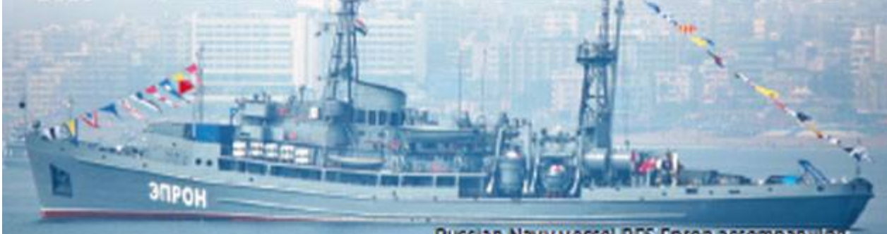
Russian Navy vessel RFS Epron accompanying the Arihant on deep sea dives and launch tests

CAN LAUNCH NUCLEAR weapons from underwater completing the nuclear trial - the ability to launch a nuclear strike from land, air or sea