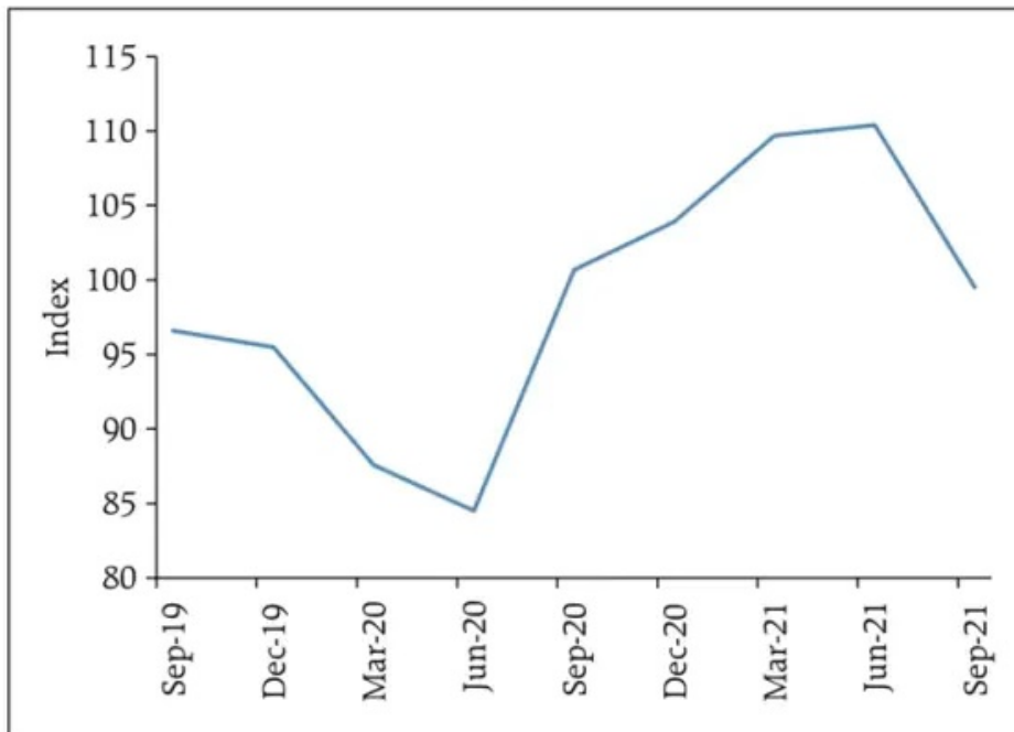
Chart 1.2: Goods Trade Barometer