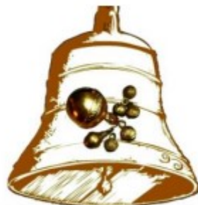
JALESAR DHATU SHILP (METAL CRAFT)