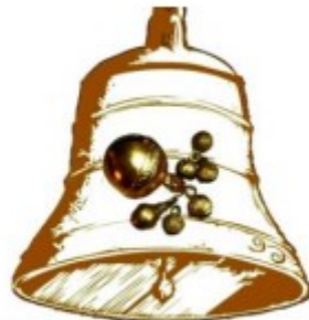
JALESAR DHATU SHILP (METAL CRAFT)