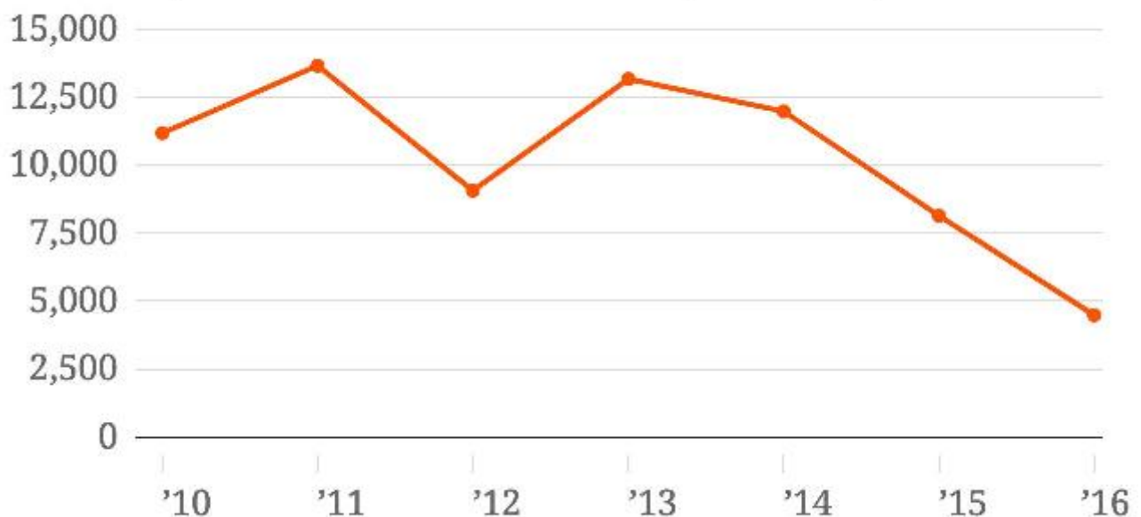
Indian deposits in Swiss bank accounts (in Rs crore)