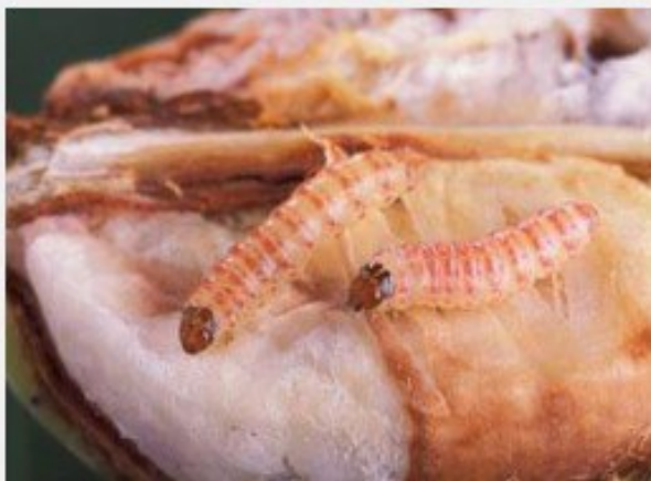
Pink bollworms emerging from a damaged cotton boll