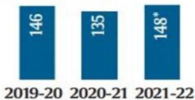
CHART 1 GDP (Rs lakh crore)

Absolute GDP is expected to claw back to pre-Covid levels, but it may happen with fewer people employed and people spending less on aggregate