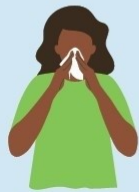
Runny or stuffy nose.